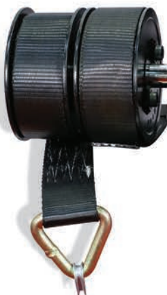
Durable polyester belts with long life span