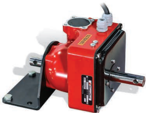
Dual shaft configuration available for reliable performance