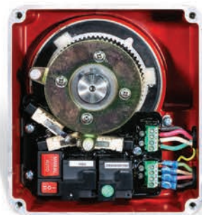
Quick and easy limit switch set-up for a high level of accuracy