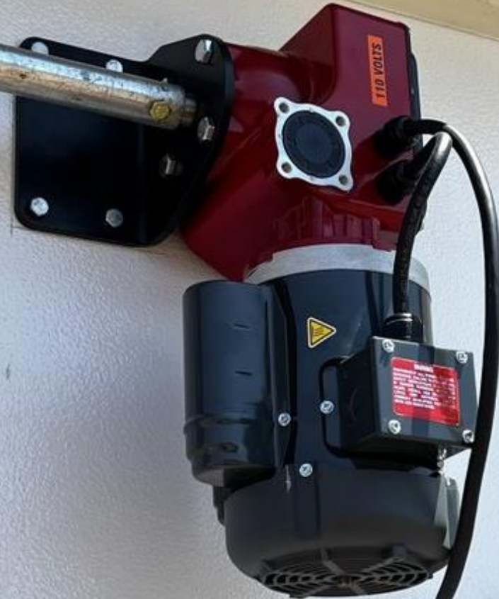
710AG3250DVMLH - G3 250 LH DuraDrive