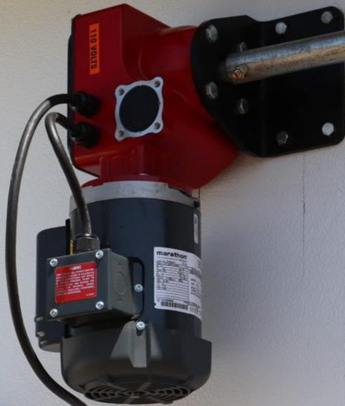
710AG3250DVM - G3 250 DuraDrive