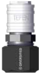
White Quick Connect Part #7TEF027