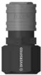
Gray Quick Connect Part #7TEF026