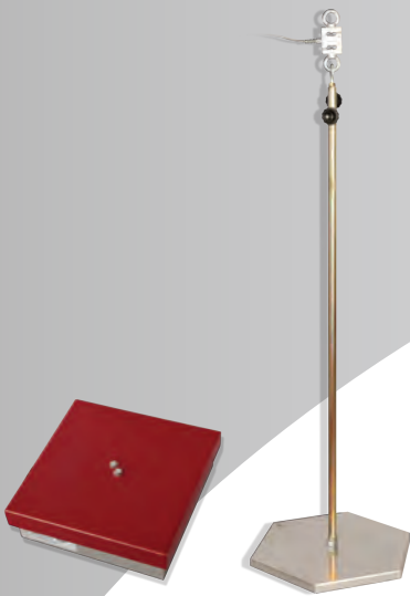
Bird Scale System

The Smart House is a range of products used in conjunction with MTech software that help achieve optimal flock management. Connect your water meter, temperature and humidity sensors, feed inventory and bird scale to your Rotem controller and communication package with Amino software to have all the necessary tools for intelligent data collection and management.