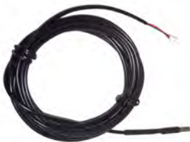
Rotem Temperature Sensor