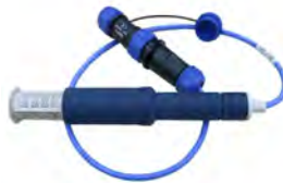
Rotem RHS Humidity Sensor