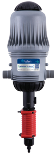
MixRite 2.5 Adjustable