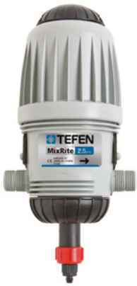
MixRite 2.5 Fixed